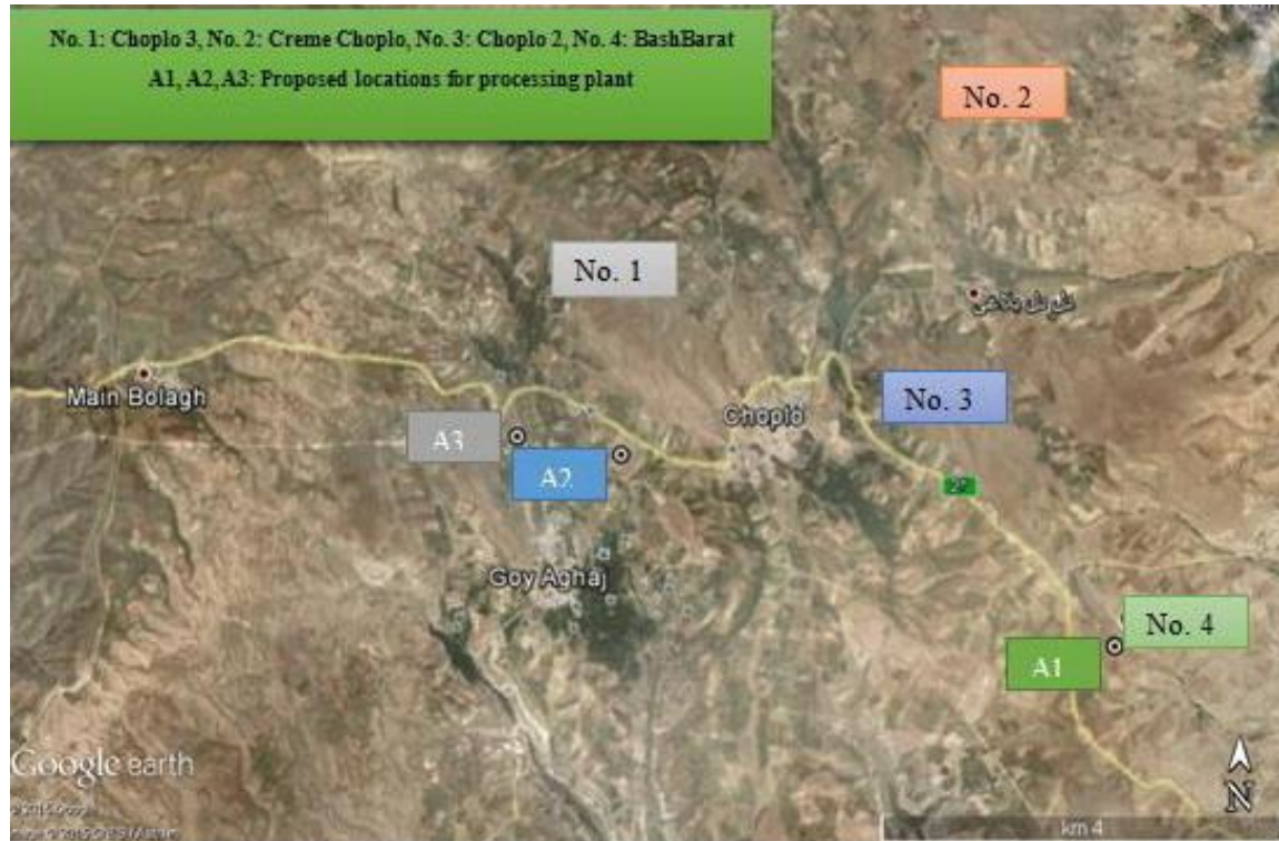
Fig. 2. Studied mines and proposed locations.