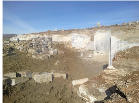
Takab Bash Barat Mine