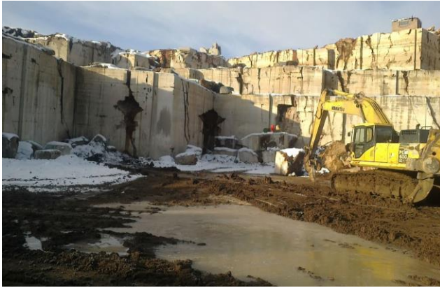
Takab Choplo No. 3 Mine