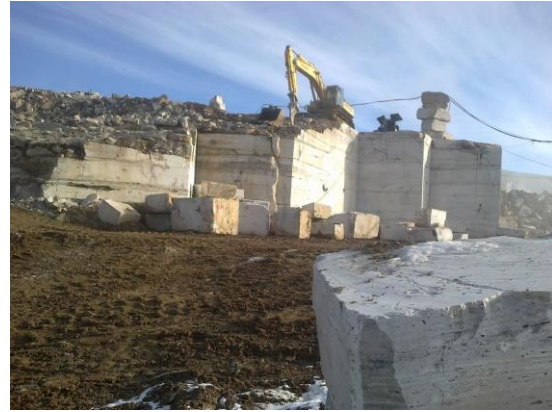
Takab creme Choplo Mine