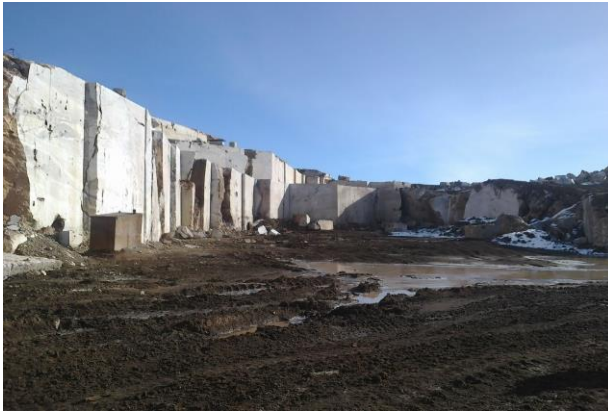
Takab Choplo No. 2 Mine